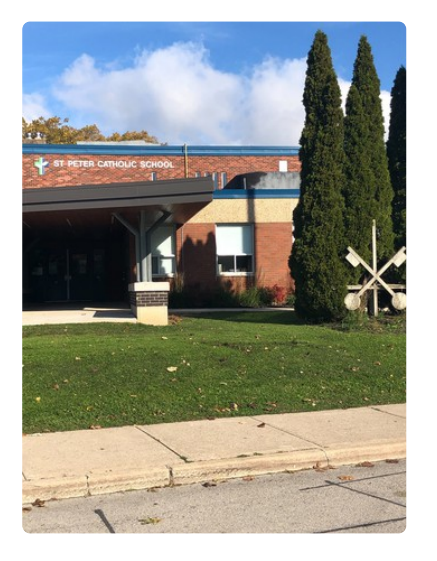
Yours in Catholic Education,

Throughout the month of April, may we reflect upon the incredible gift we have present in our Churches, the real and true presence of Christ with us and among us, and may we take the opportunity to spend time with Him in adoration!